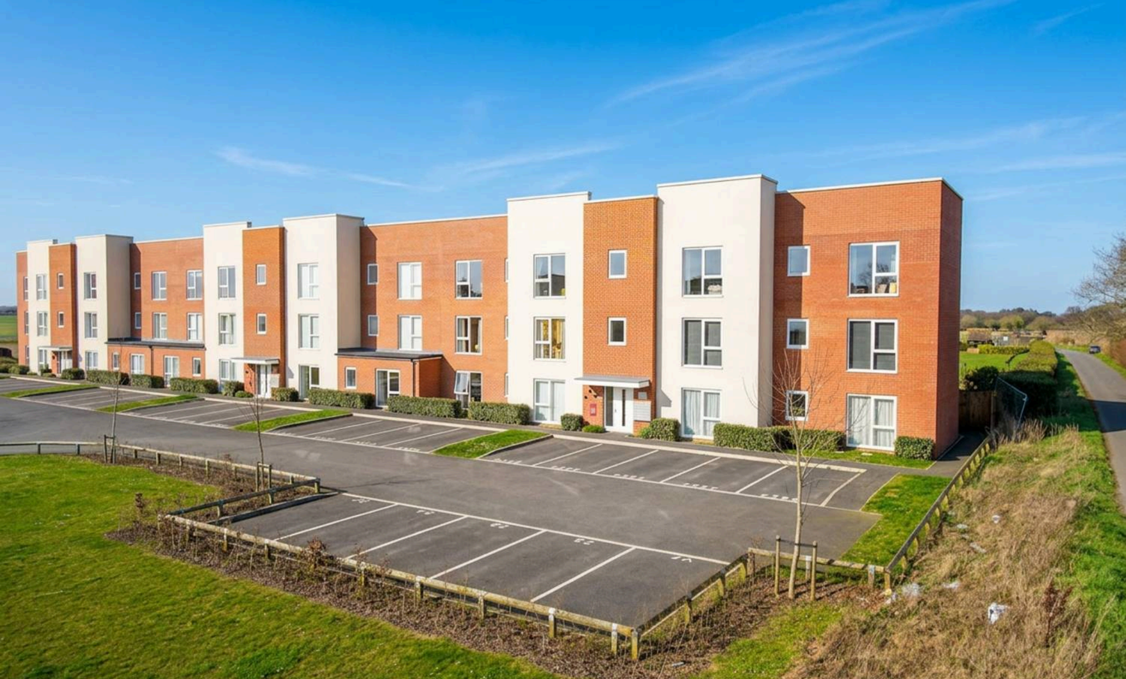
Juby Court, Norwich - NR6 7FS