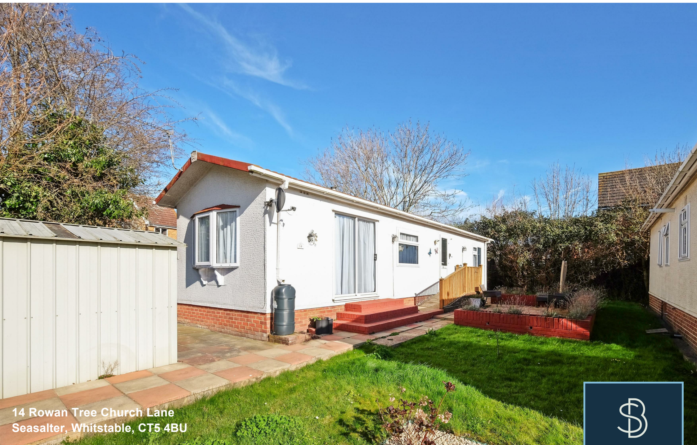
14 Rowan Tree Church Lane Seasalter, Whitstable, CT5 4BU