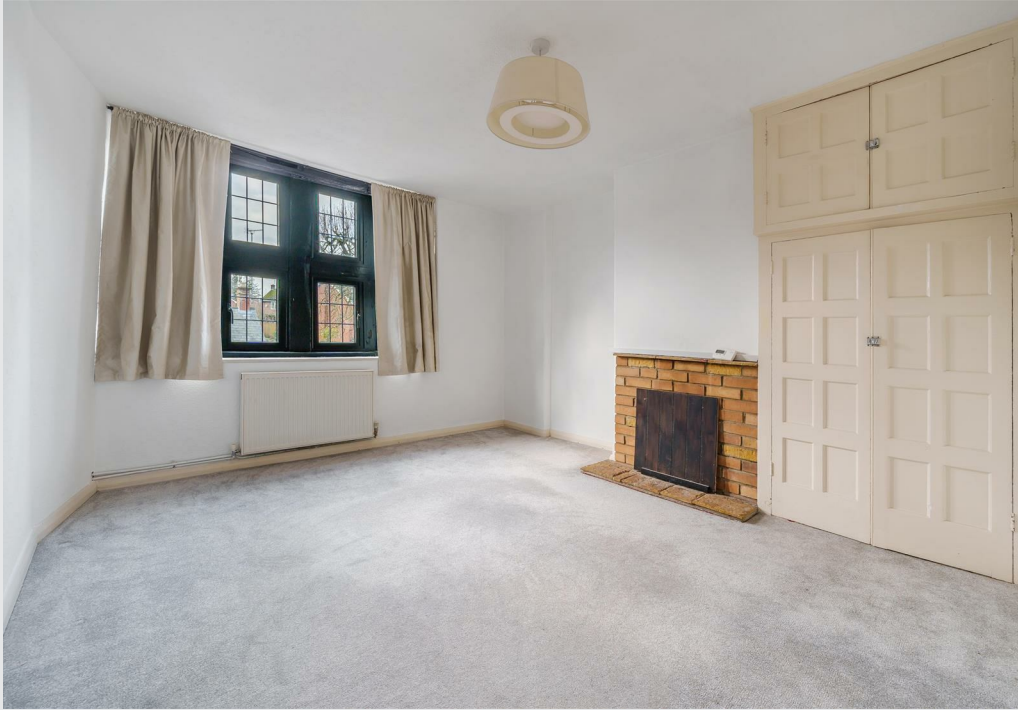
A sought after apartment in this characterful Landmark parade, with super accommodation throughout. Hall : Kitchen with Appliances : Living Room : Double Bedroom : Double Glazed windows in Oak Mullioned frames : Storage Cupboards : 1 Mile from Station (Waterloo 42 mins.) : No Onward Chain