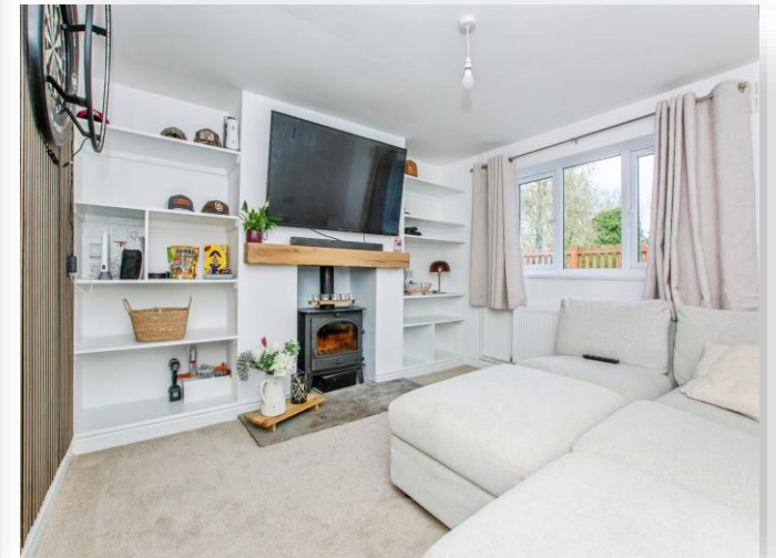
Church Road, Emneth, Wisbech, PE14 8AA