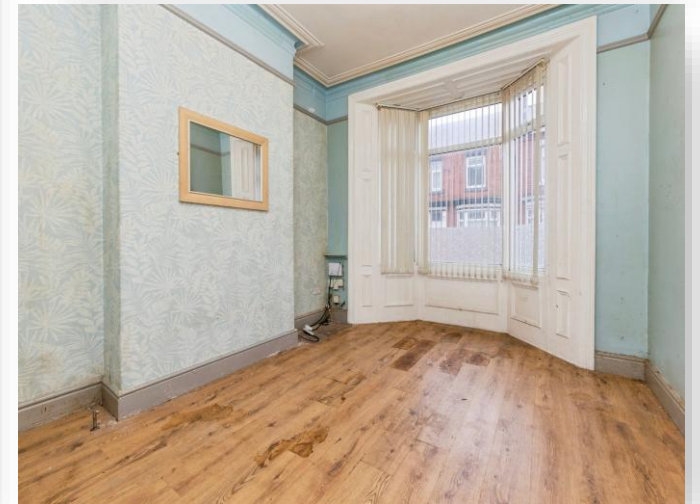
Carlton Street, Hartlepool TS26 9ES