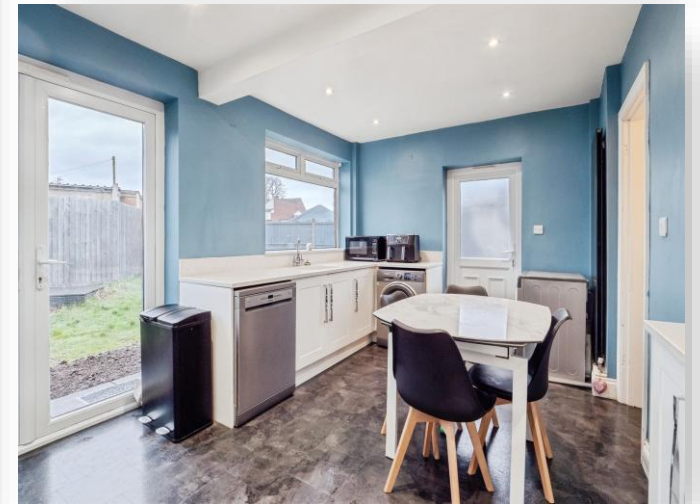
Amy Street, Leicester LE3 2FA