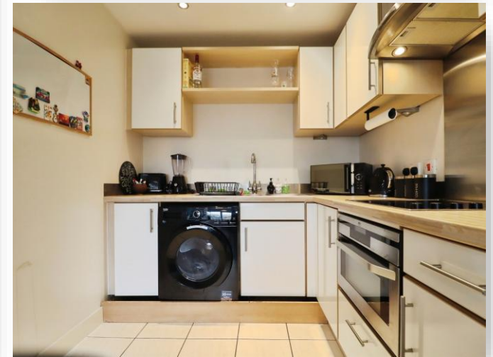
Breakwater House, Ferry Court, Cardiff, CF11 0JQ