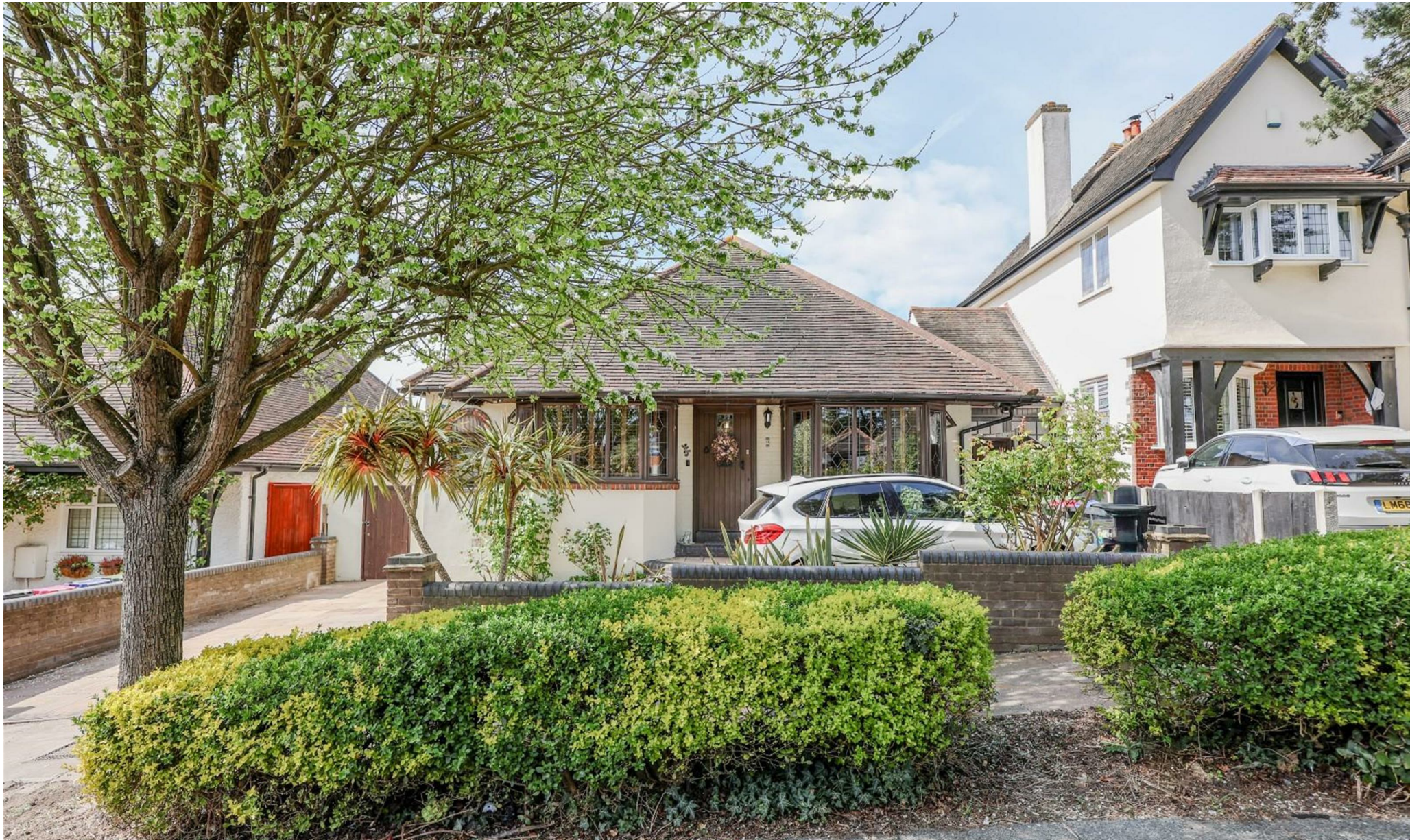
Hall Park Avenue, Chalkwell £1,200,000