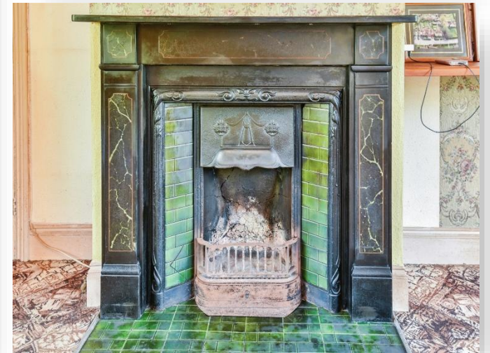
Westbury Road, Bratton Westbury BA13 4TE