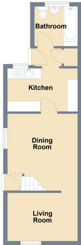
Ground Floor Approx. 34.3 sq. metres (369.3 sq. feet)