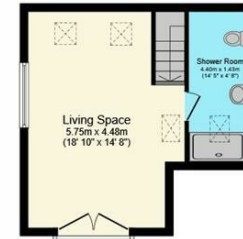
Annexe First Floor Floor area 30.6 m 2 (329 sq.ft.)