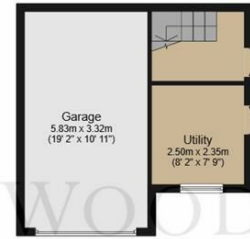
Annexe Ground Floor Floor area 31.5 m 2 (339 sq.ft.)