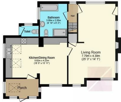
Ground Floor Floor area 67.3 m 2 (725 sq.ft.)