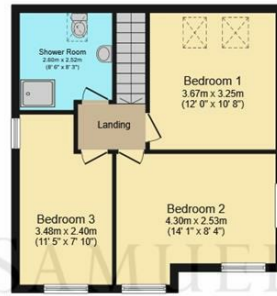
First Floor Floor area 49.0 m 2 (527 sq.ft.)