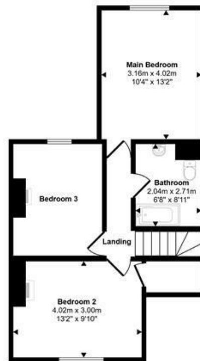
First Floor Approx 49 sq m / 529 sq ft

This floorplan is only for illustrative purposes and is not to scale. Measurements of rooms, doors, windows, and any items are approximate and no responsibility is taken for any error, omission or mis-statement. Icons of items such as bathroom suites are representations only and may not look like the real items. Made with Made Snappy 360.