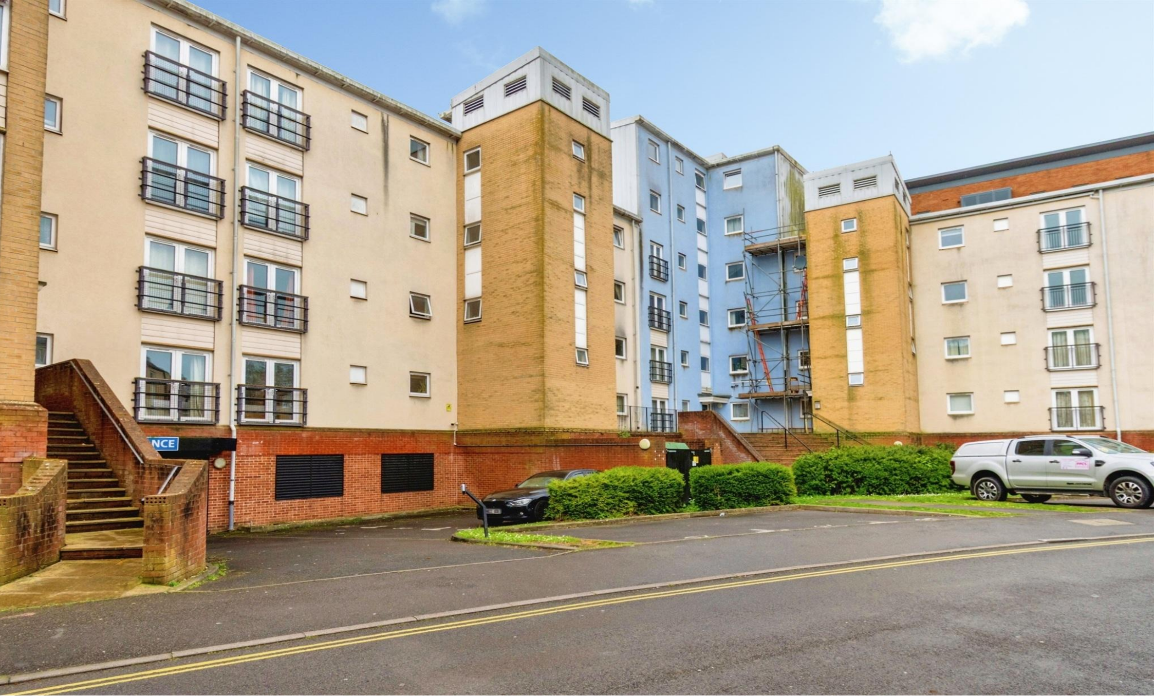
White Star Place, Southampton SO14 3GN