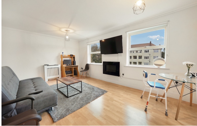
WILSHAW CLOSE, HENDON NW4