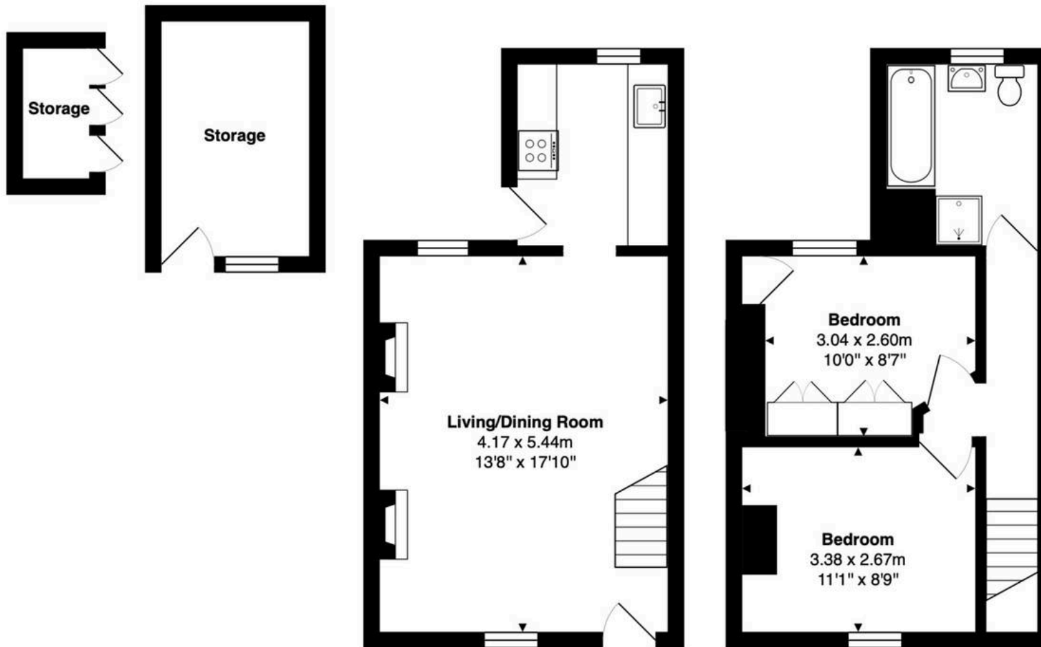
Ground Floor Area: 28.7 m 2 ... 309 ft 2