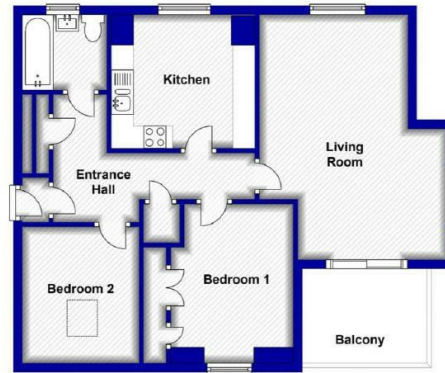
Sketch Plan: Not To Scale. For Illustrative Purposes Only Plan produced using The Mobile Agent.