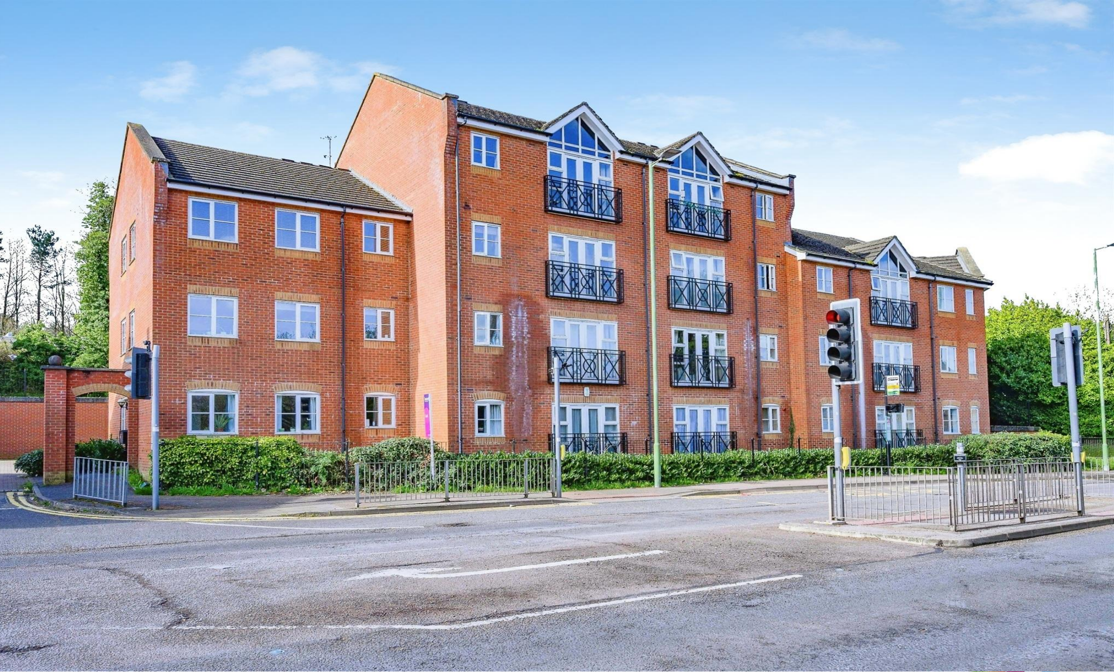
Harriet House London Road, Hemel Hempstead HP3 9GE