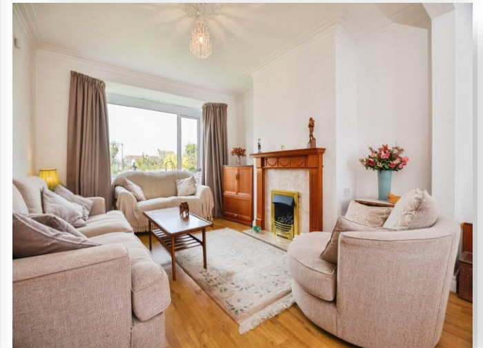
Burford Avenue, Stockton-On-Tees TS18 3QD