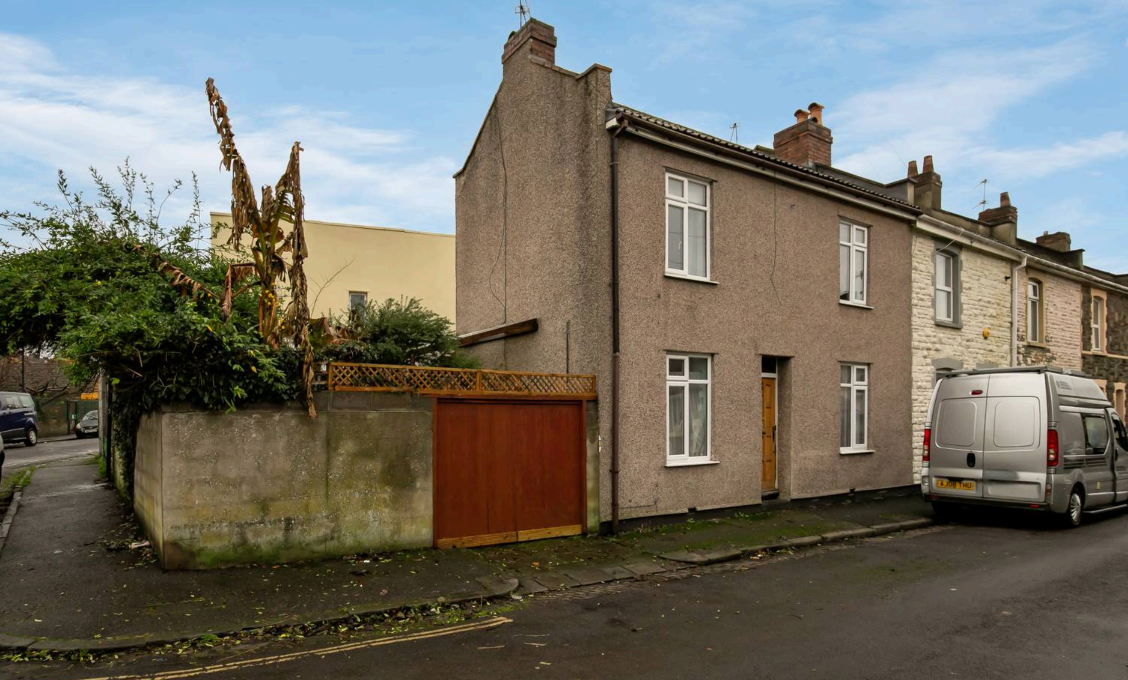
56 Heber Street, Bristol £350,000