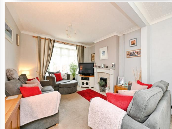
St. Peters Road, West Lynn, King's Lynn, PE34 3LG