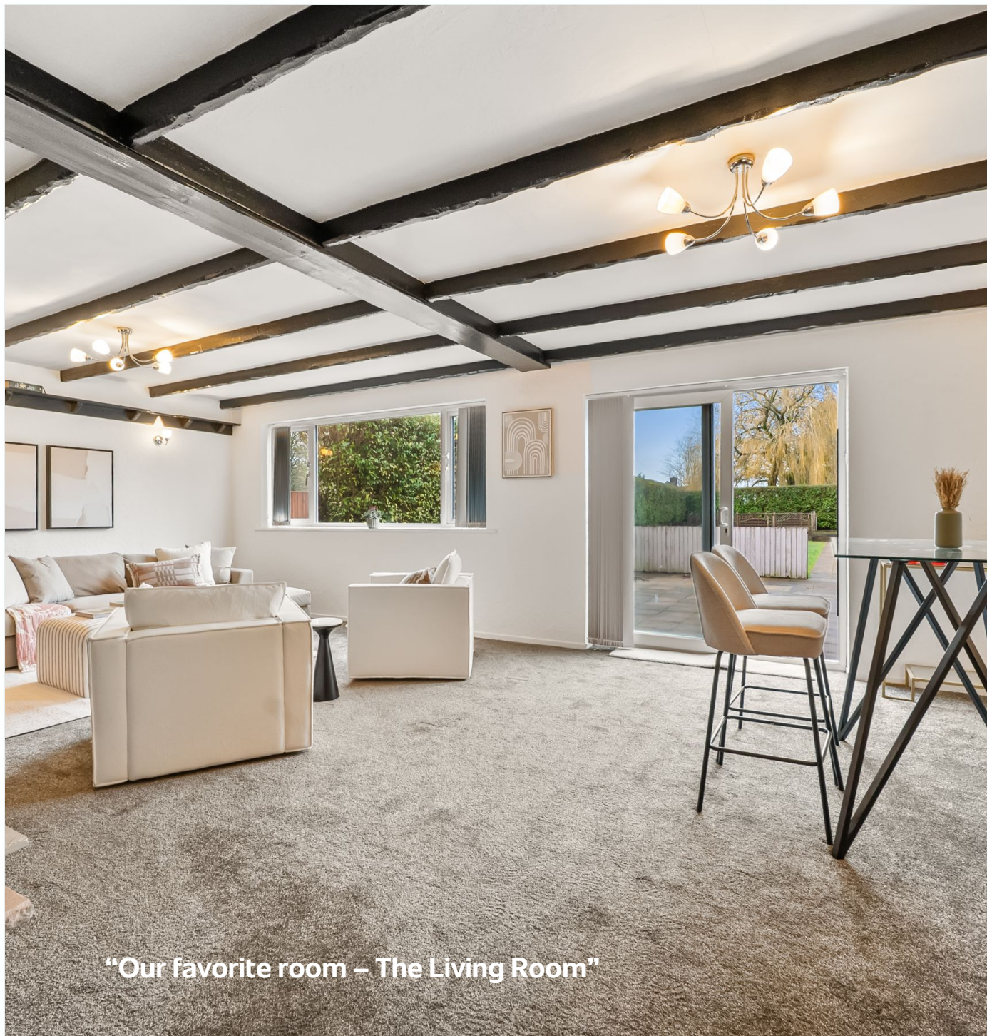
“Our favorite room – The Living Room”

Belbroughton has been a fantastic place to live, with a lovely village community and beautiful countryside all around. We’ve made many happy memories here and hope the next owners enjoy the home just as much as we have.”