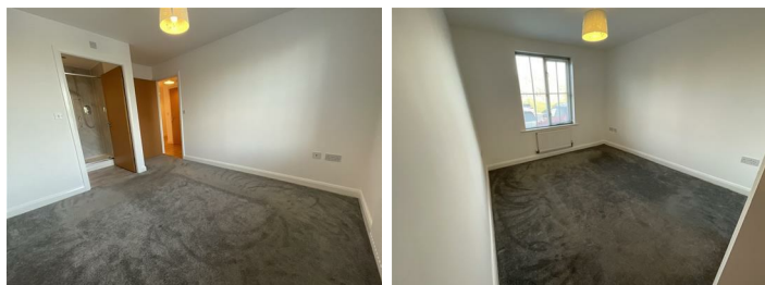
Bedroom one 13'1" x 9'8" (3.99 x 2.95)