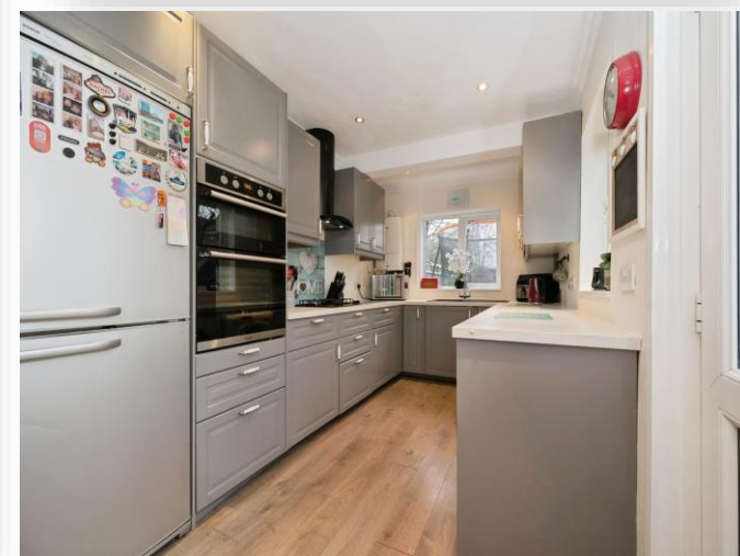
Porchester Road, Southampton SO19 2JD