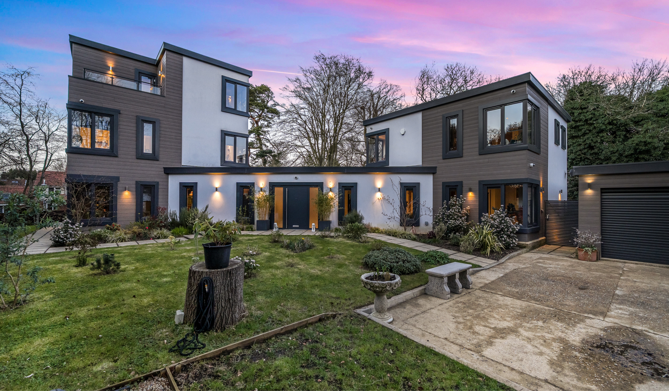
Ridge House, 16D Harvey Lane Norwich, Norfolk, NR7 0BN