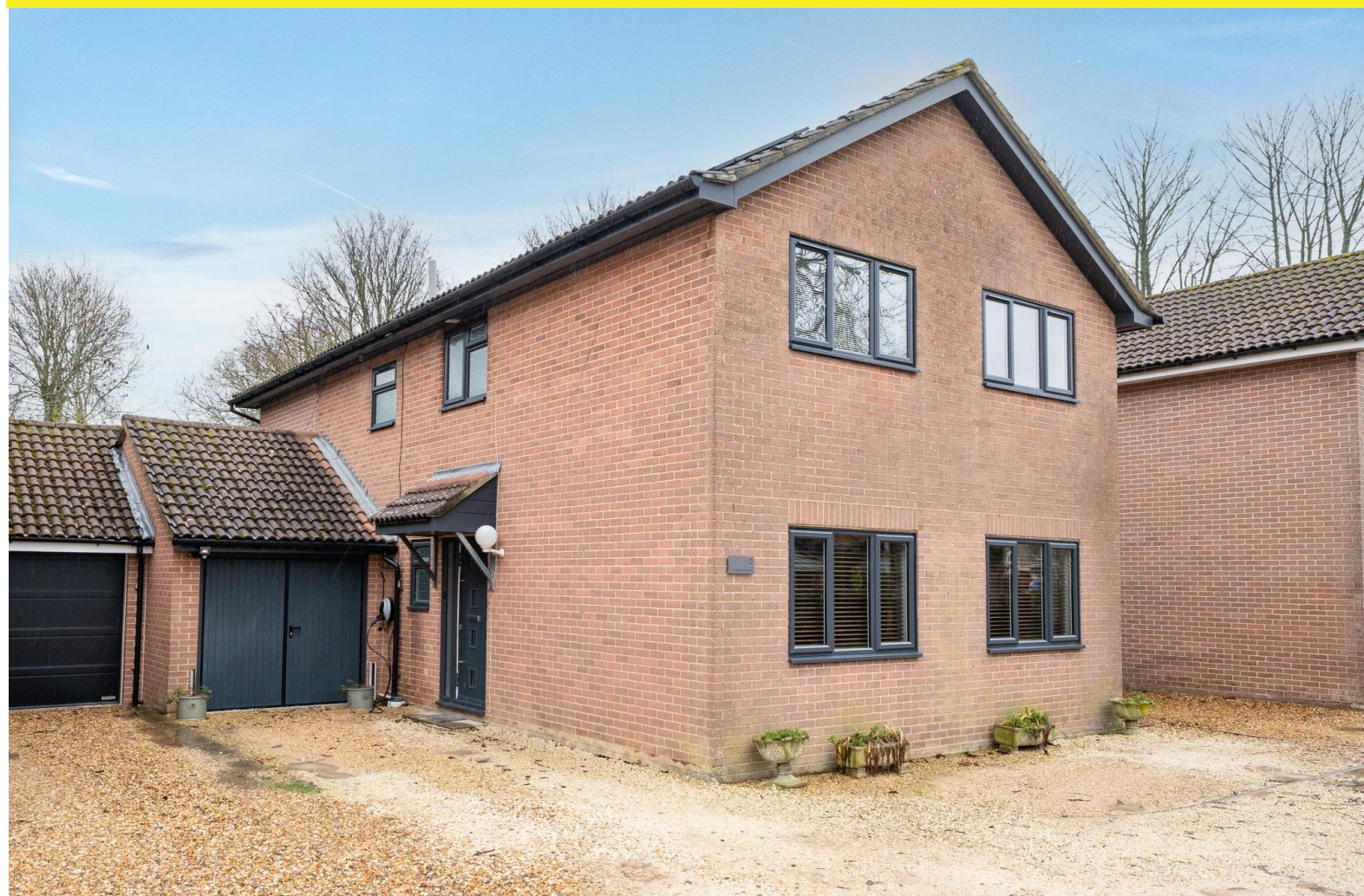
Old Farmhouse Close, Shipton Bellinger

NOTE: These particulars are only intended as a guide to prospective purchasers with a view to taking up negotiations. They are not intended to be relied upon in any way for any purpose and accordingly neither their accuracy nor their continued availability is in any way guaranteed. They are furnished on the express understanding that neither the Agents nor the Vendors are under any liability or claim in respect of their contents. Any prospective purchaser must satisfy themselves by inspecting or otherwise as to the correctness of the particulars contained.