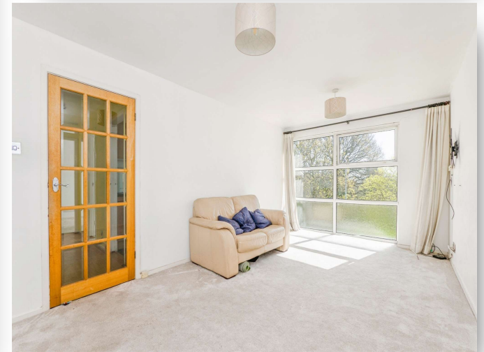
Glenwood, Llanedeyrn Cardiff CF23 6UW