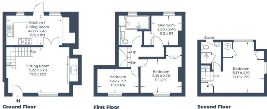
Illustration for identification purposes only, measurements are approximate, not to scale. © CJ Property Marketing Produced for Oakleys