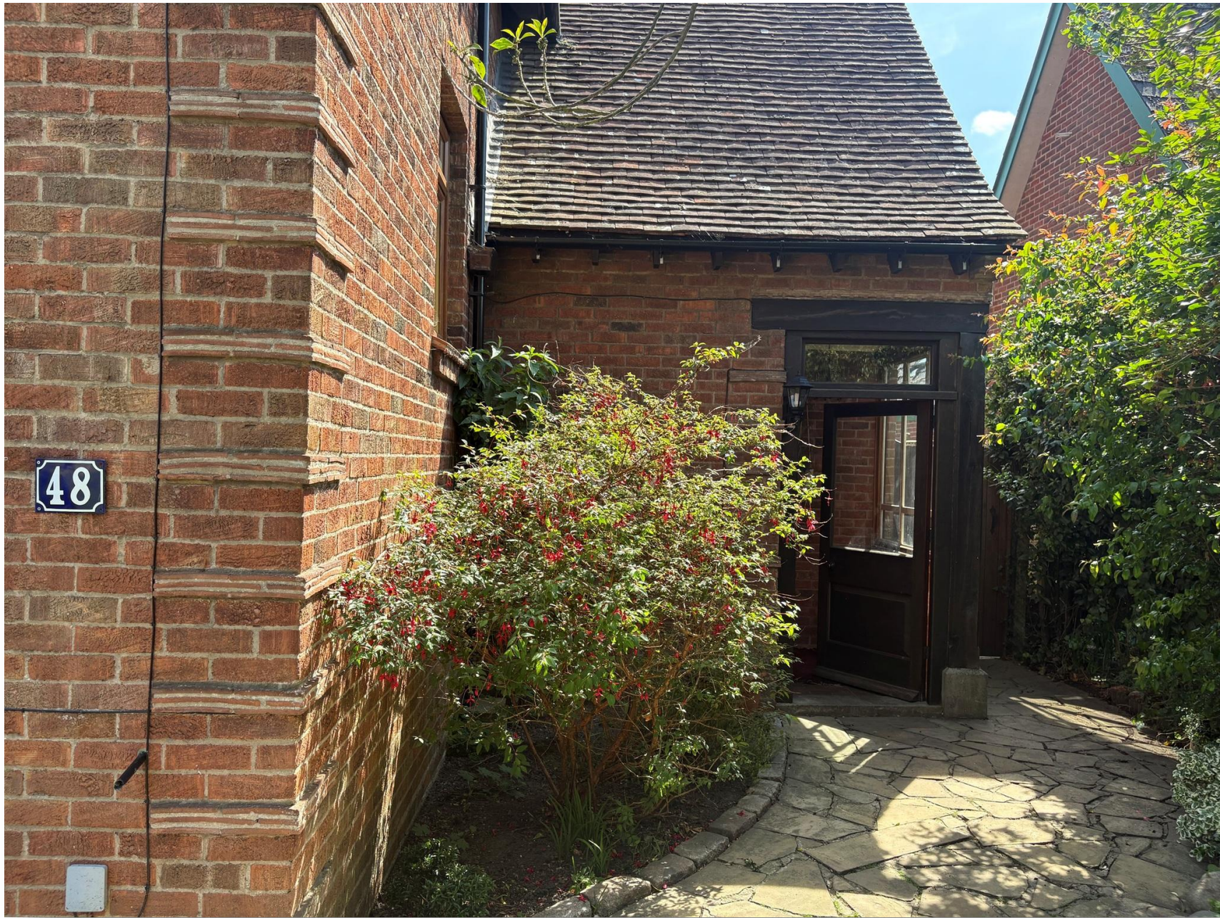
Goodwins Road, King's Lynn, PE30 5QX