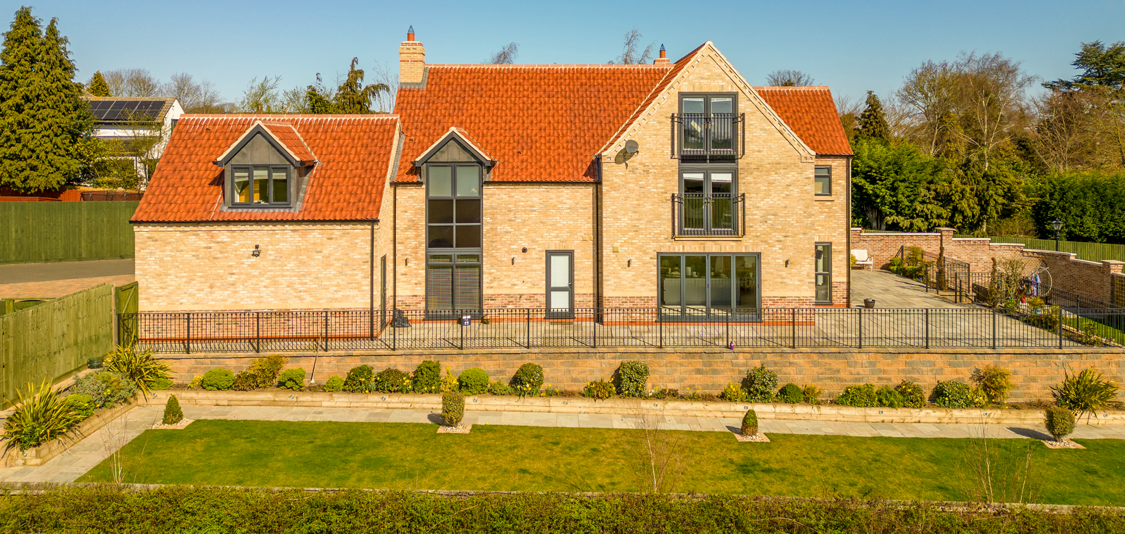
1 Lysterfield End Nettleham, Lincoln