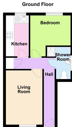
This plan is to be used only as an indication of the floor layout and is not to scale. Plan produced using PlanUp.