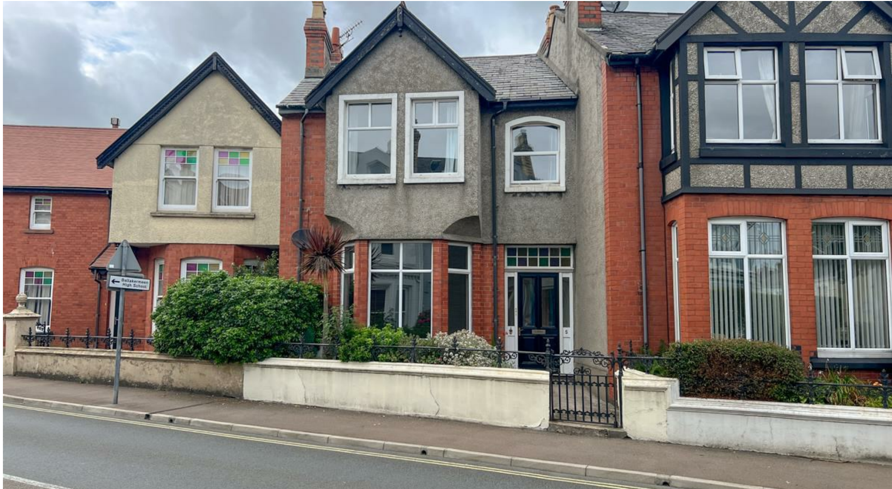
5 Marlborough Terrace, Douglas, Isle Of Man, IM2 3QJ Asking Price £335,000