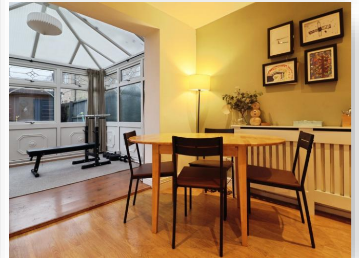
Cosmeston Drive, Penarth, CF64 5FA