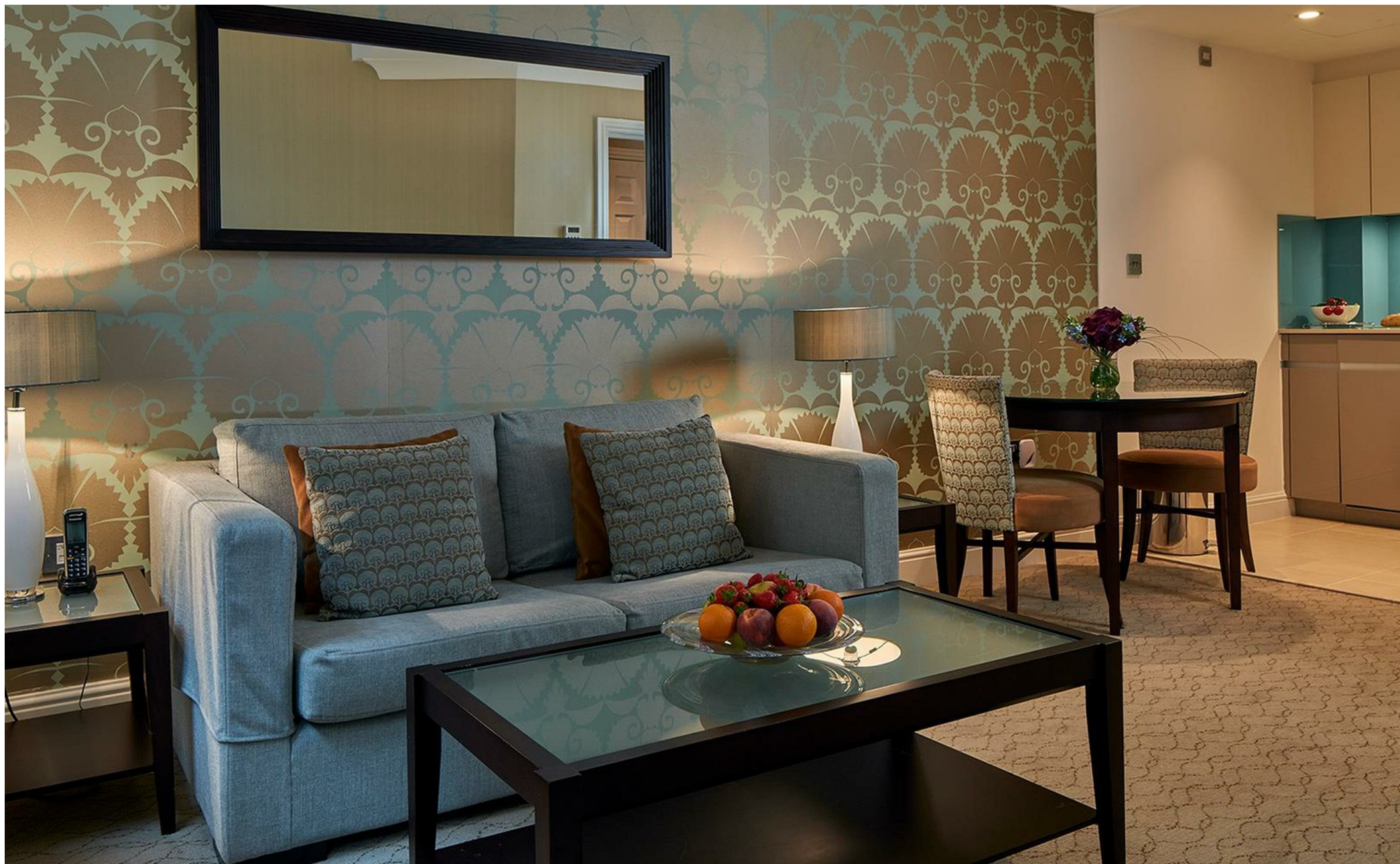
Calico House Bow Lane, London, EC4M 9DT £3,683