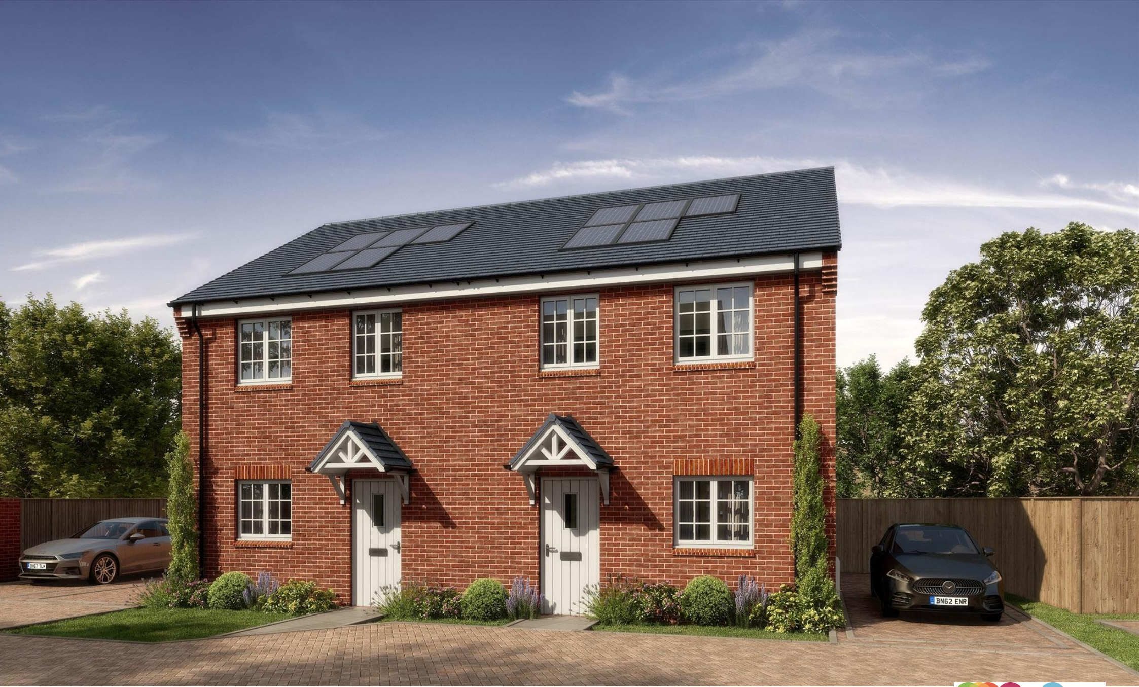
The Goldcrest, Barrowby Place, Grantham NG31 8AE