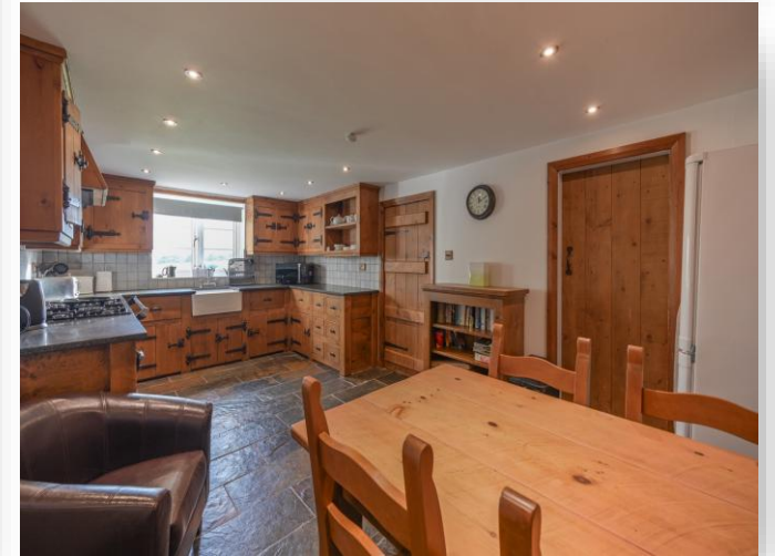
Springfield Barn, Bradley Lane, Alton, Stoke-On-Trent. ST10 4DQ