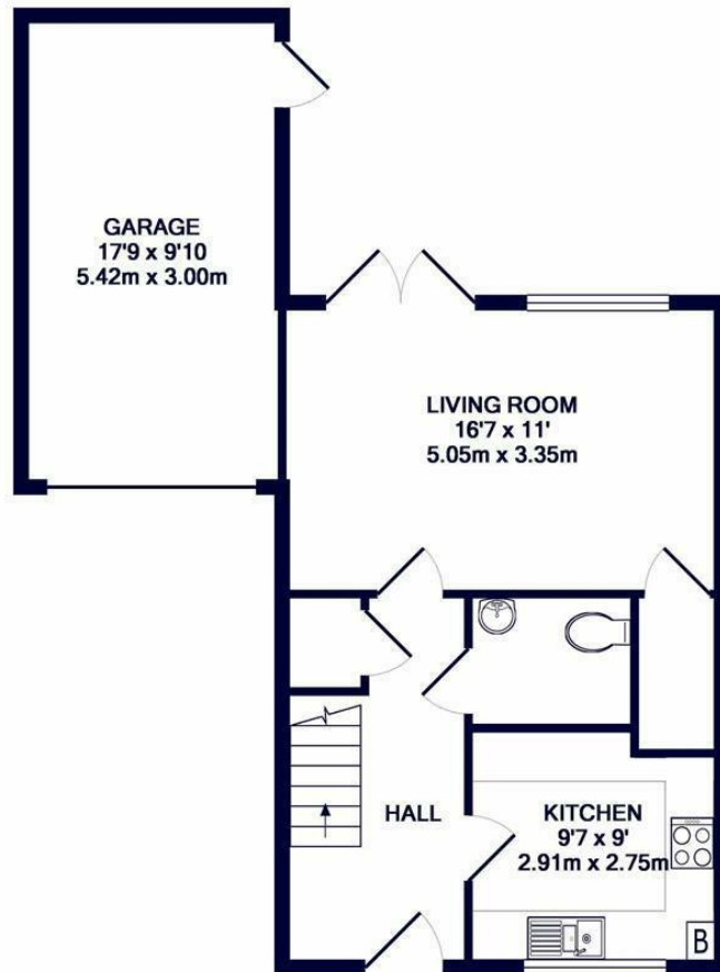
GROUND FLOOR APPROX. FLOOR AREA 590 SQ.FT. (54.8 SQ.M.)