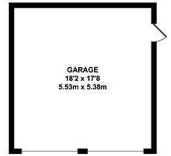
OUTBUILDING APPROX. FLOOR AREA 320 SQ.FT. (29.75 SQ.M.)

TOTAL APPROX. FLOOR AREA 3078 SQ.FT. (285.93 SQ.M.)