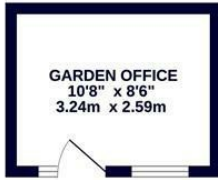
OUTBUILDING 90 sq.ft. (8.4 sq.m.) approx.