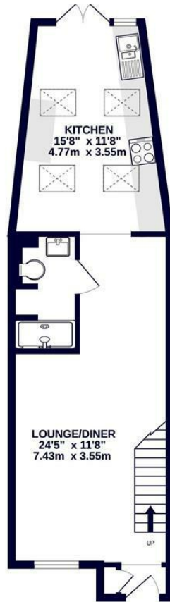
GROUND FLOOR 445 sq.ft. (41.4 sq.m.) approx.