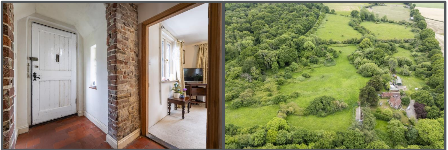
Illustration for identification purposes only, measurements are approximate, not to scale. (ID1156637)

Approximate Gross Internal Area = 141.5 sq m / 1523 sq ft Outbuildings = 258.6 sq m / 2784 sq ft Total = 400.1 sq m / 4307 sq ft