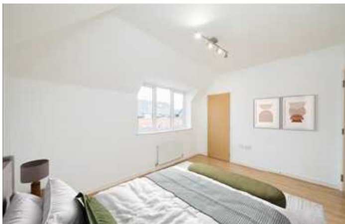
Academy Place, TW7