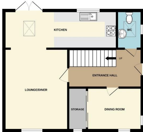
GROUND FLOOR 544 sq.ft. (50.5 sq.m.) approx.