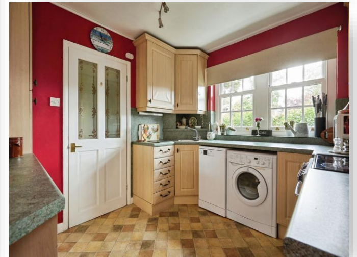
1 Fairways Court Salisbury Street, Amesbury Salisbury SP4 7AW