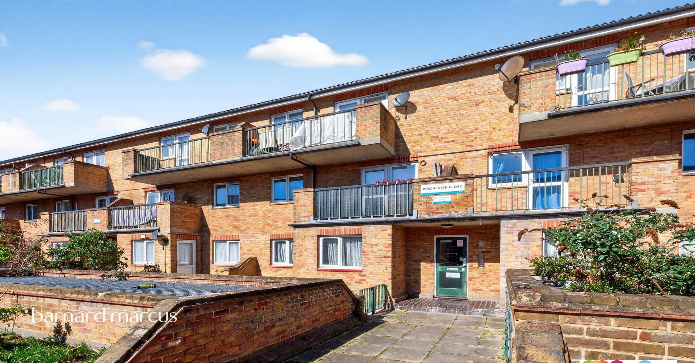
Winchester Close, LONDON SE17