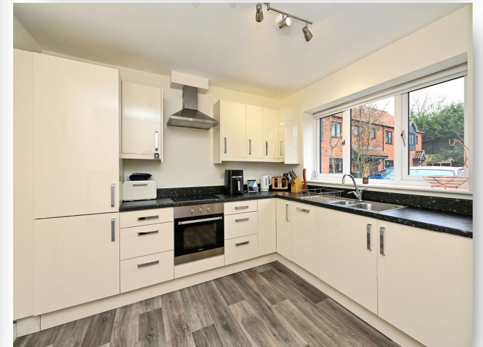
Old Mill Close, Whittington, KING'S LYNN, PE33 9TR