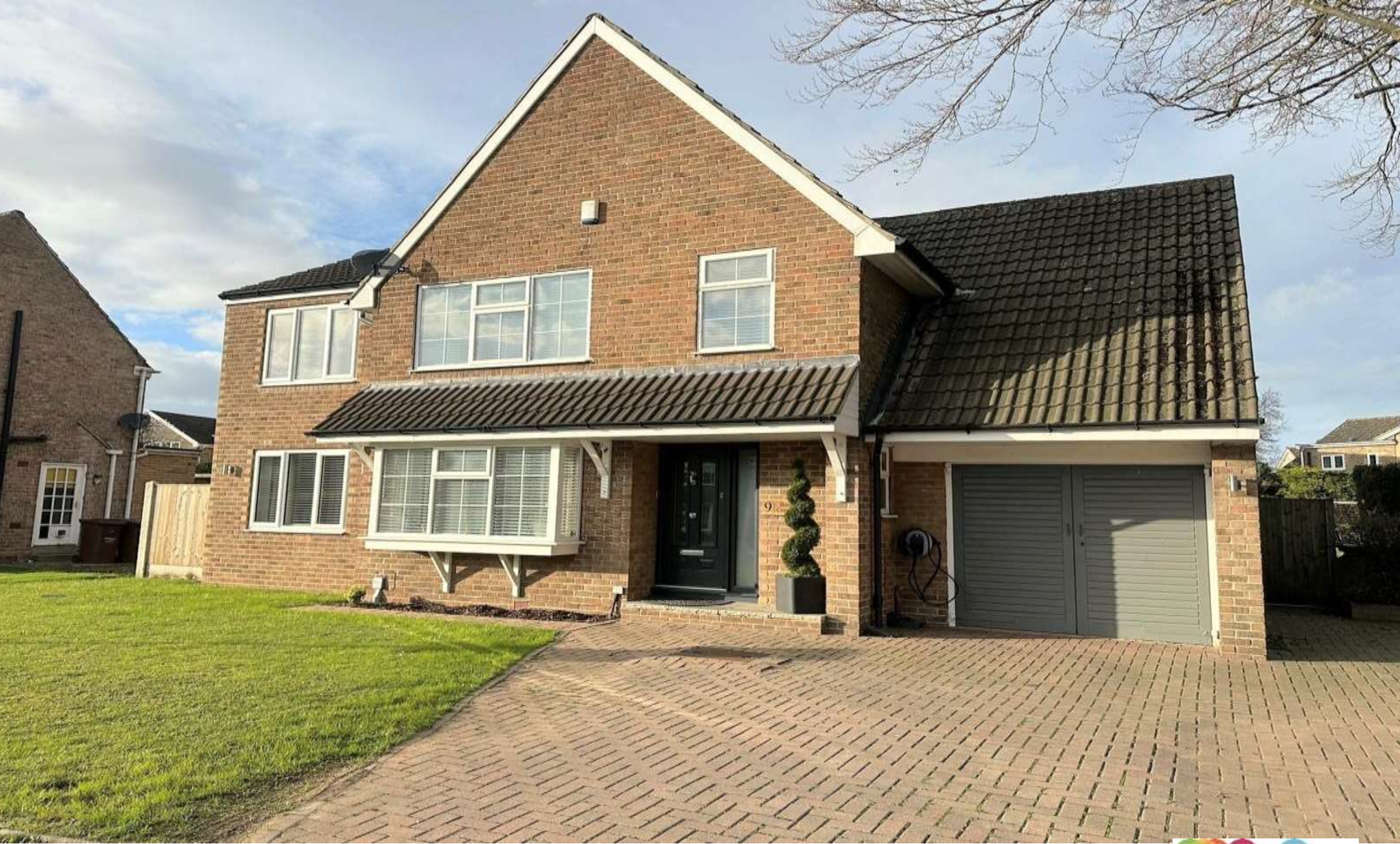
Beech Crescent, Darrington Pontefract WF8 3AD