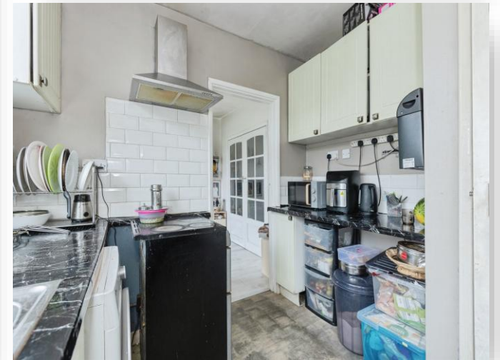
Duncan Road, Leicester LE2 8EE