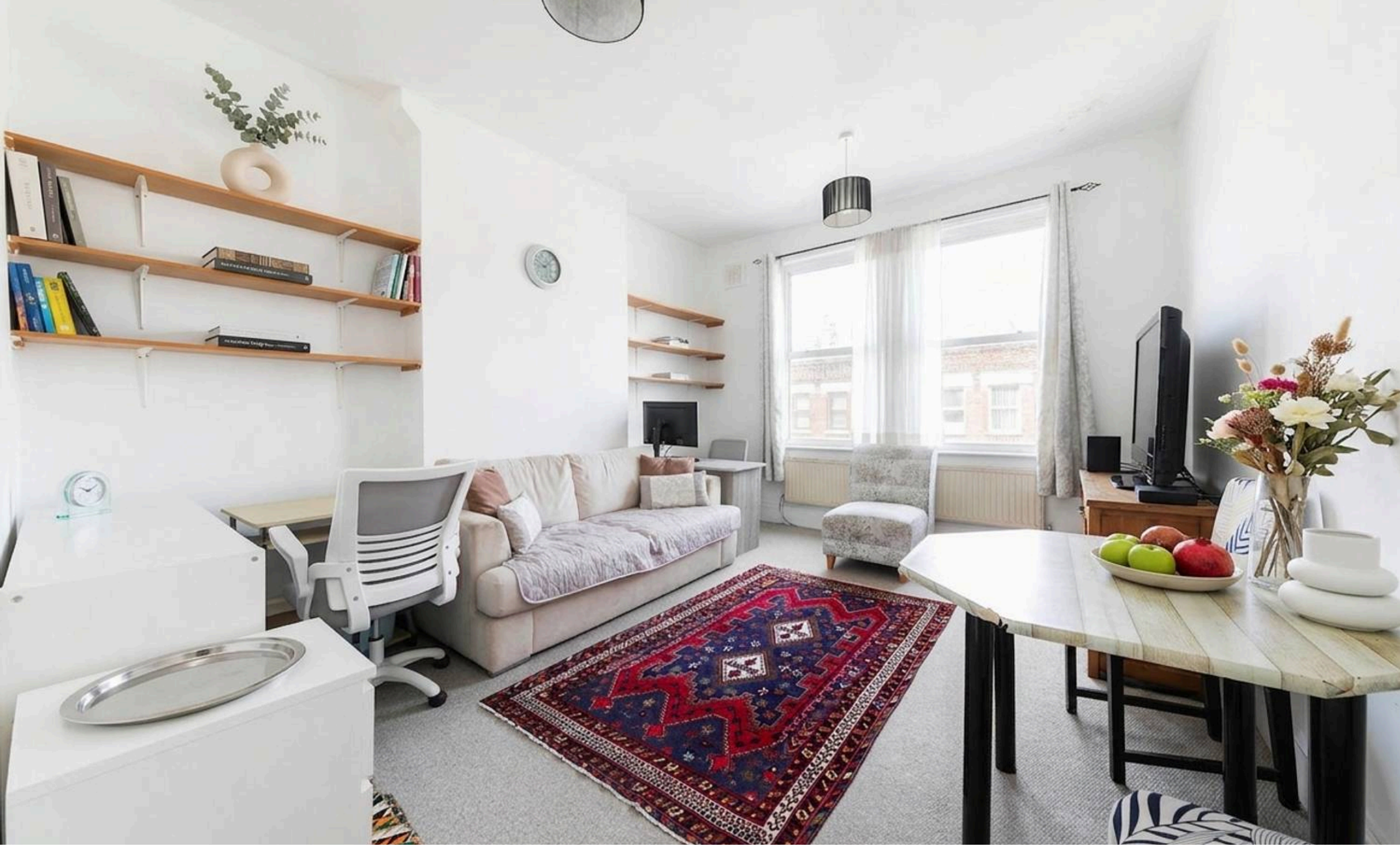
Chamberlayne Road, Kensal Rise, NW10 £1,950 pcm