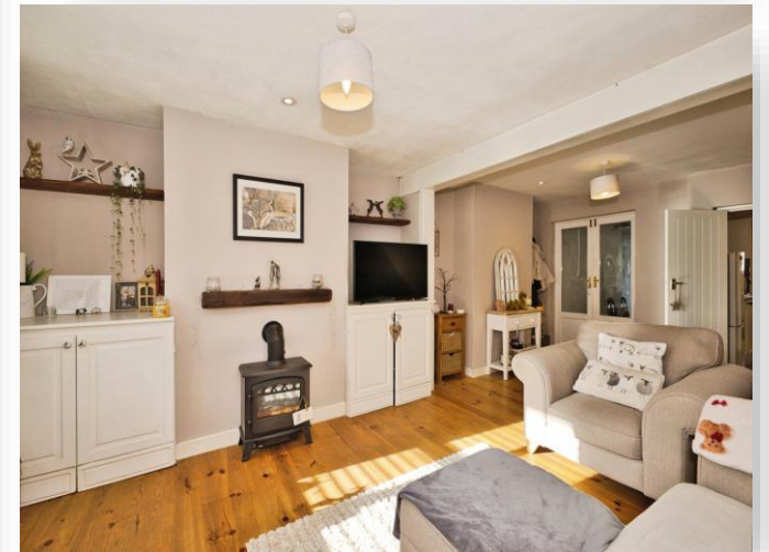
Huish, Yeovil, BA20 1BJ