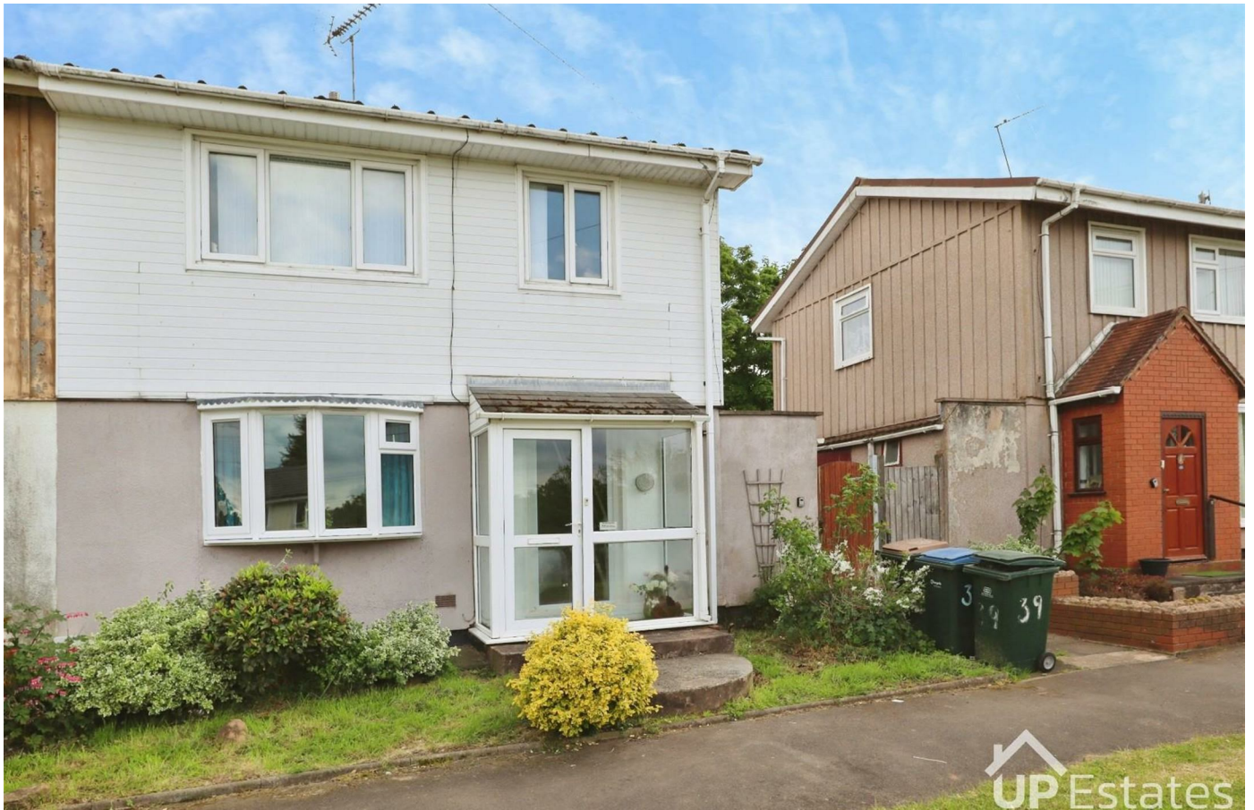
Howcote Green, Coventry