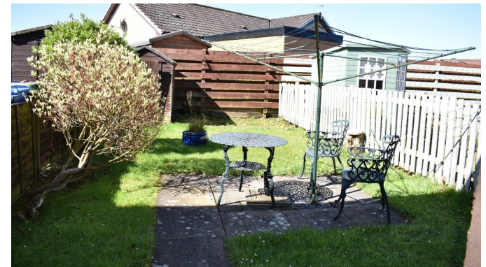
32 Young Crescent